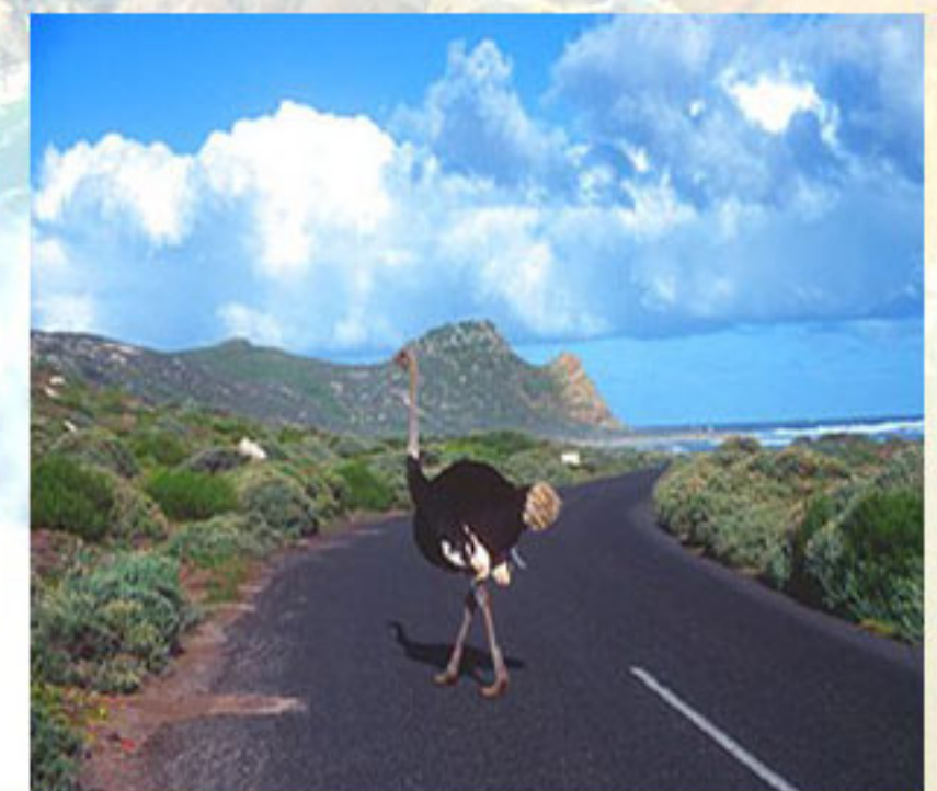
An ostrich at Cape of Good Hope