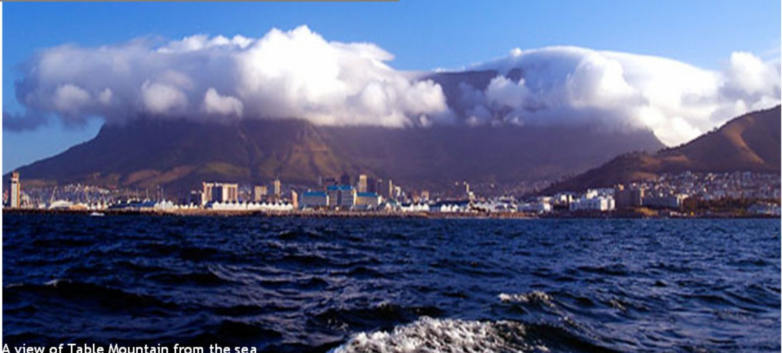
A view of Table Mountain from the sea