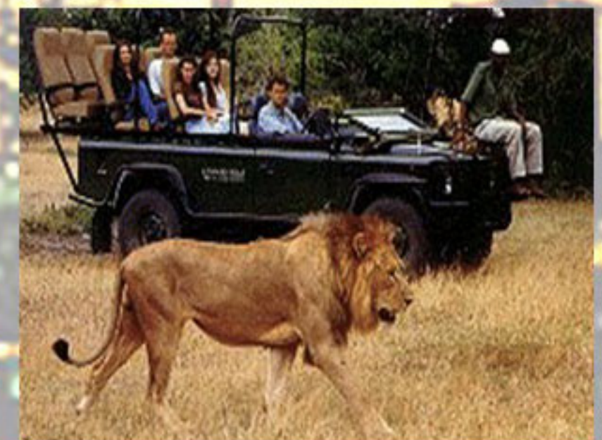
A lion sighted in game drive