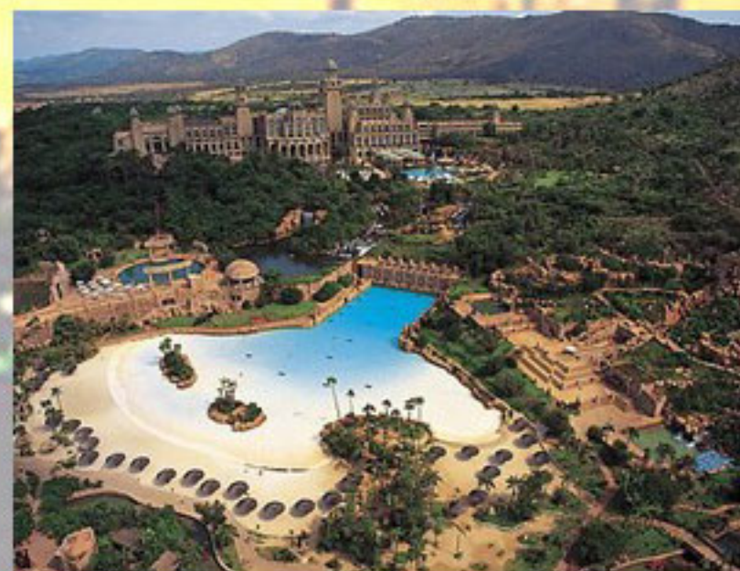
An aerial view of Sun City